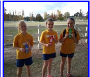
Some of the place winners at the school cross country held last Friday afternoon.