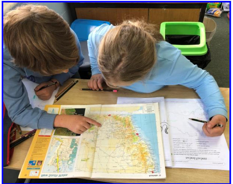
Gabe & Jaylan using an atlas to locate places in Australia