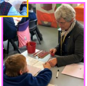
Mrs Stokes working with our Southern Ocean class

"I am an SLSO currently working in the Southern Ocean to assist student's during learning activities to reach their maximum potential across all areas of learning. I love to eat lasagne and my favourite colour is pink."