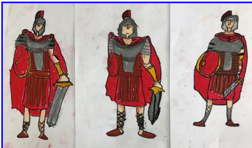
Some Gladiator artworks. A sneak peek at what some of 3-4 will look like in our school play.