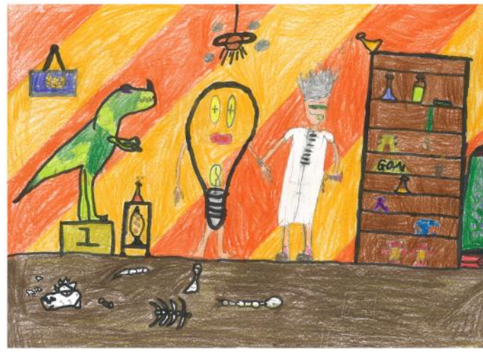
Ryan, Class 5/6