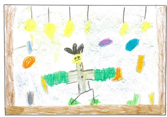
Finlay, Class 1/2