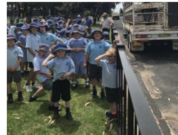
The day BLUEY came to school!

absolute pleasure to work with such invested parents in a collaborative and supportive environment. On behalf of our students, staff and myself, THANK YOU!