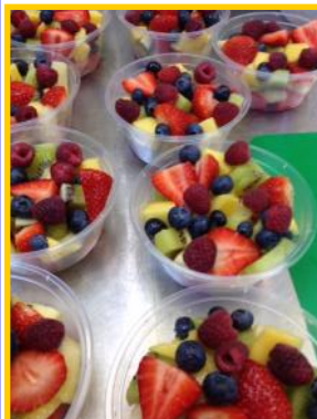
Just look at this delicious food and produce from our canteen and veggie gardens

Any donations of non-perishable food items, Christmas items or any other goods can be delivered to the office.