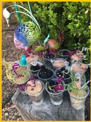
Our seeds are growing!

We have been very focussed on writing this fortnight. We've written up a procedure about growing our seeds, a recount about our sports day, descriptions of dinosaurs and free choice topics in Writing for Stamina - what a variety of learning! We have been reading There's a Dinosaur in My Garden and Mr Christofis has organised some fun activities around it for our Daily 5 rotations. Talking about food... We had a delicious time picking strawberries and carrots in our school garden.