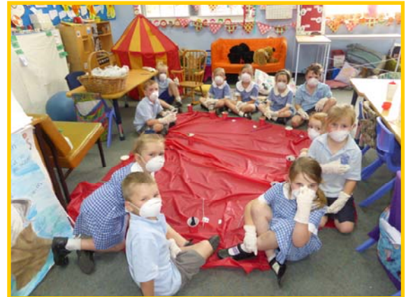
In our safety gear ready to start our seedling experiment.

We have been very focussed on writing this fortnight. We've written up a procedure about growing our seeds, a recount about our sports day, descriptions of dinosaurs and free choice topics in Writing for Stamina - what a variety of learning! We have been reading There's a Dinosaur in My Garden and Mr Christofis has organised some fun activities around it for our Daily 5 rotations. Talking about food... We had a delicious time picking strawberries and carrots in our school garden.