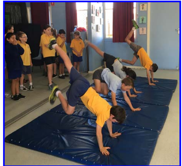
3/4 at Gymnastics this week.