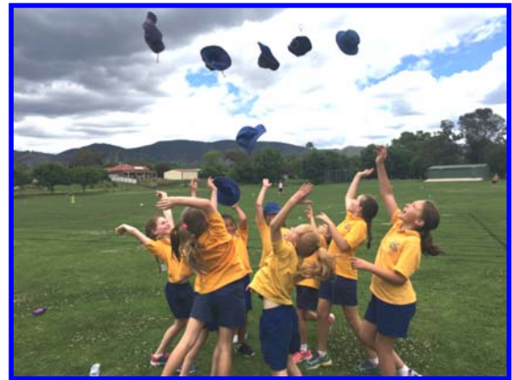
The 3-4 girls celebrate a great day at the cricket on Friday.