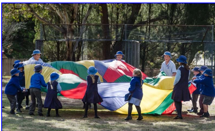
Fun activities at lunchtime with the SRC

"We have also been practising our numbers, shapes and measuring. Phew..."