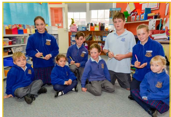
Our School Leaders interview our younger students for the Wellbeing Wall