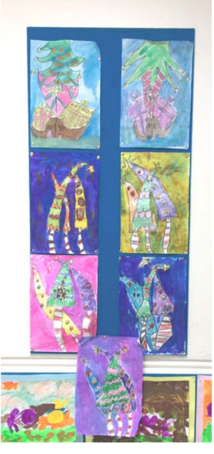
Just a few of 1/2's Christmas Tree artworks.